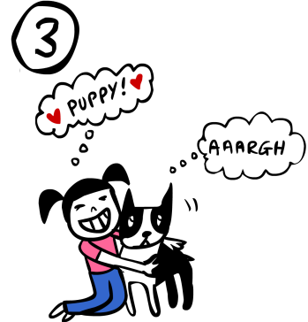
DON'T Grab or Hug him