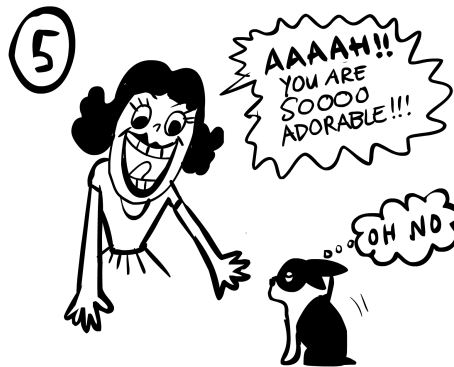
DON'T Squeal or shout in his face