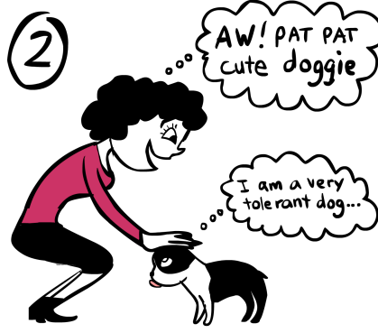
DON'T Lean over the dog & stick your hand on top of his head