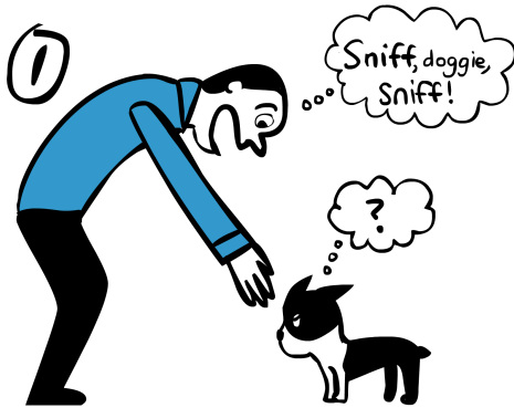
DON'T Lean over the dog & stick your hand in his face

Most people do this stuff and it stresses dogs out so they BITE! Please show dogs some respect.