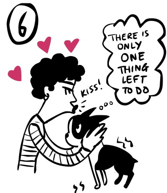
DON'T Grab his head and kiss it (This is an invasion of space)

Doing this to a dog who doesn't know you is like a perfect stranger giving you a great big hug and kiss in an elevator. Wouldn't that creep you out? And wouldn't you have the right to defend yourself?