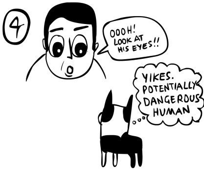
DON'T Stare him in the eye (This is an adversarial gesture)